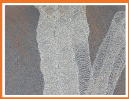
Water Blasting With Rotating Nozzles.