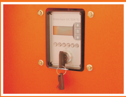
Electronic Engine Controller.