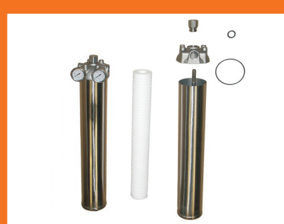
Strainers & Filtration.