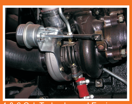
4 & 6 Cyl. Turbocharged Engines