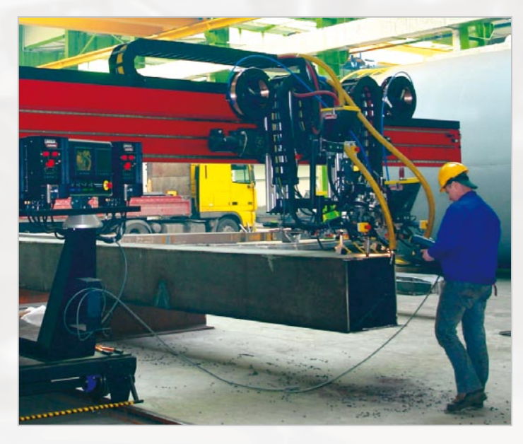
Integration with various power sources controller - here: process START/STOP from C&B control panel.

All our Column&Booms are equipped with passive safety systems such as safety chains, automatic brakes on a gear motor in case of power failure.