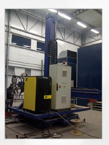
Standard Column & Boom with ESAB Aristo 1000 AC/DC