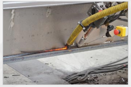
Installation and commissioning of Column&Boom at the customer's site