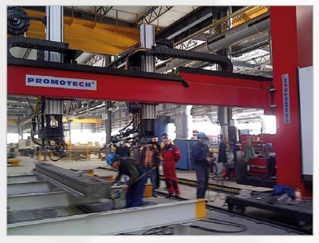
Half Gantry Beam and Tank Welding System C&B type WA with LINCOLN ELECTRIC PW AC/DC 1000 SD