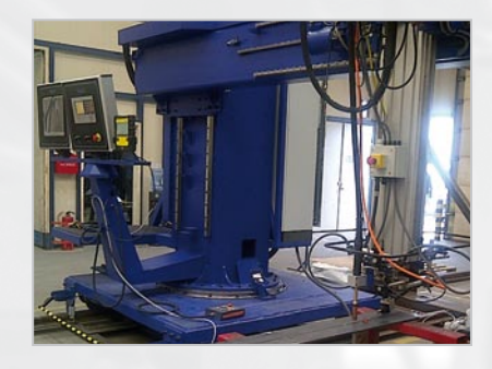
Production and tests at Promotech location in Bialystok/Poland.