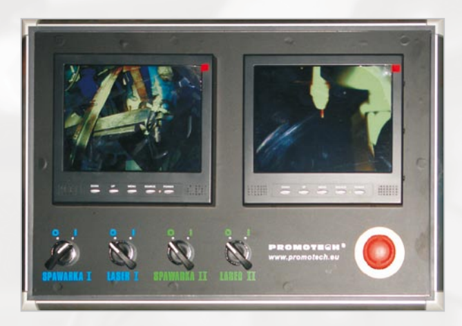
Optional equipment includes: camera system for GMAW/SAW, automatic correction of welding gun position or remote control.

Active safety systems such as limit switches to prevent collisions are also in standard .